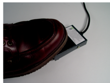
Foot Pedal Operated