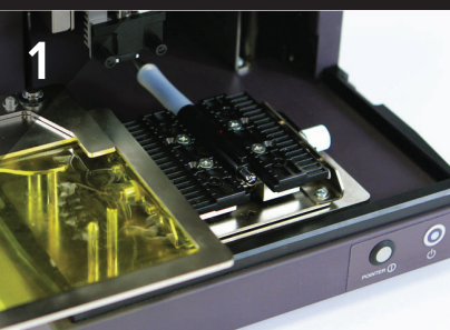
1 Place your object in the machine

The LD-80 has no complicated operating procedures and provides a simple 4-step process.