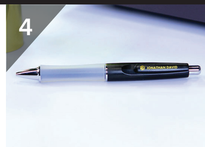
4 Your customized object is ready to sell