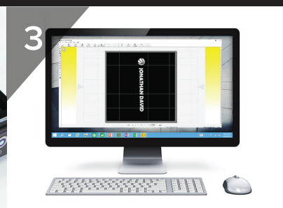
3 Laser imprint your design via METAZAStudio Software