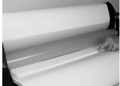
4. use starter sled to thread laminate.