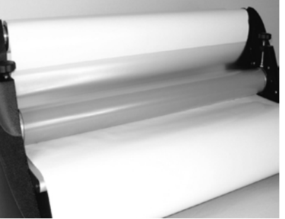
6. pull laminate smooth and taught against top roller