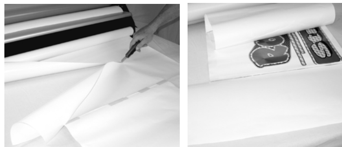
8. cut off liner paper in front 9. tape liner paper to the bottom of the trailing edge and cut off 12" width.