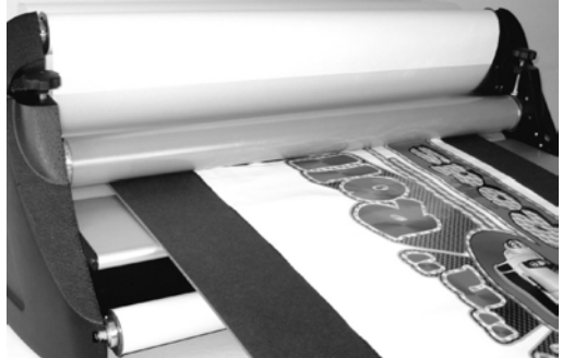
7. Insert sled into rollers and place print on sled.

7. Take your regular sled and insert it into the rollers. Place your print on top of the sled. Be sure to clean off the image side so you do not trap any dirt under the laminate. Turn on the motor and run the print through the rollers for laminating.